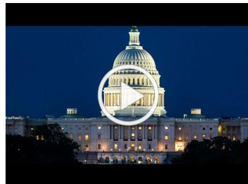
2016 UCA Chinese American Convention Washington D.C.